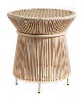
pastel beige/beige/pearl white 01ACAHT-V