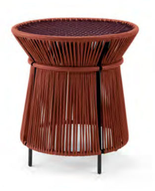
copper/black red/black 01ACAHT-O