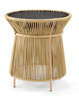
beige/black/beige pink 01ACAHT-W