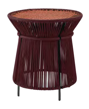
black red/copper/black 01ACAHT-N