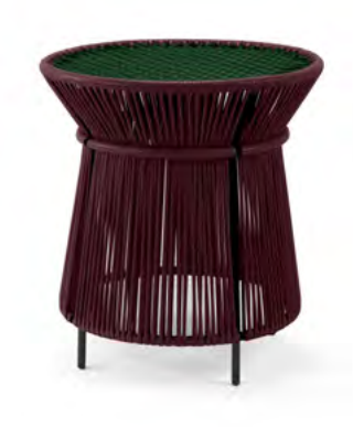
black red/moss green/black 01ACAHT-M