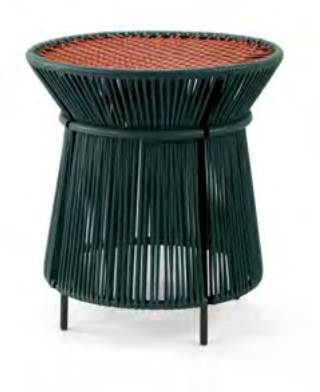
moss green/copper/black 01ACAHT-I