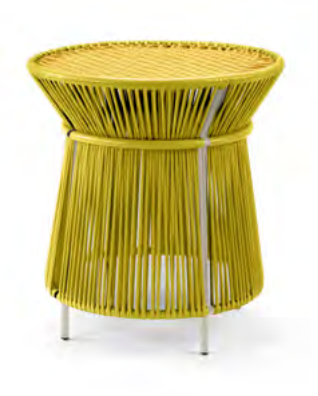
curry yellow/honey yellow/ pearl white 01ACAHT-U